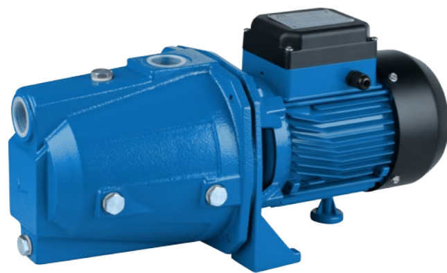
JET-JM Series pump