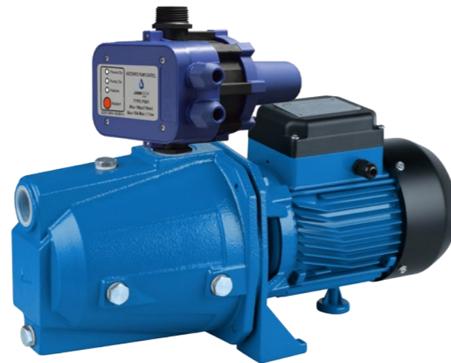
JET-JM Series pump with PS-01 controller Available for: JET-JM100