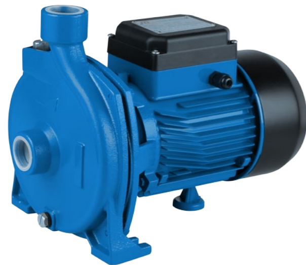
CPM Series pump