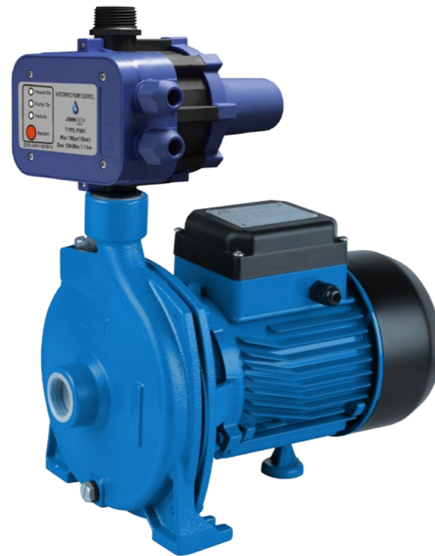
CPM Series pump with PS-01 controller