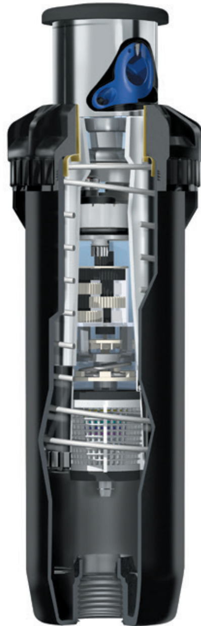
Falcon 6504 Cutaway

▲ Triangular spacing based on 50% diameter of throw