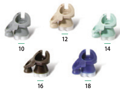
Falcon® 6504 Rain Curtain™ Nozzles